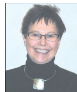
I am very excited to be given the chance to being part of this team and look forward being part of this wonderful Association.

A Service to celebrate the work that Carers do Carers, their cared-for, family, friends and professionals are all welcome to come along