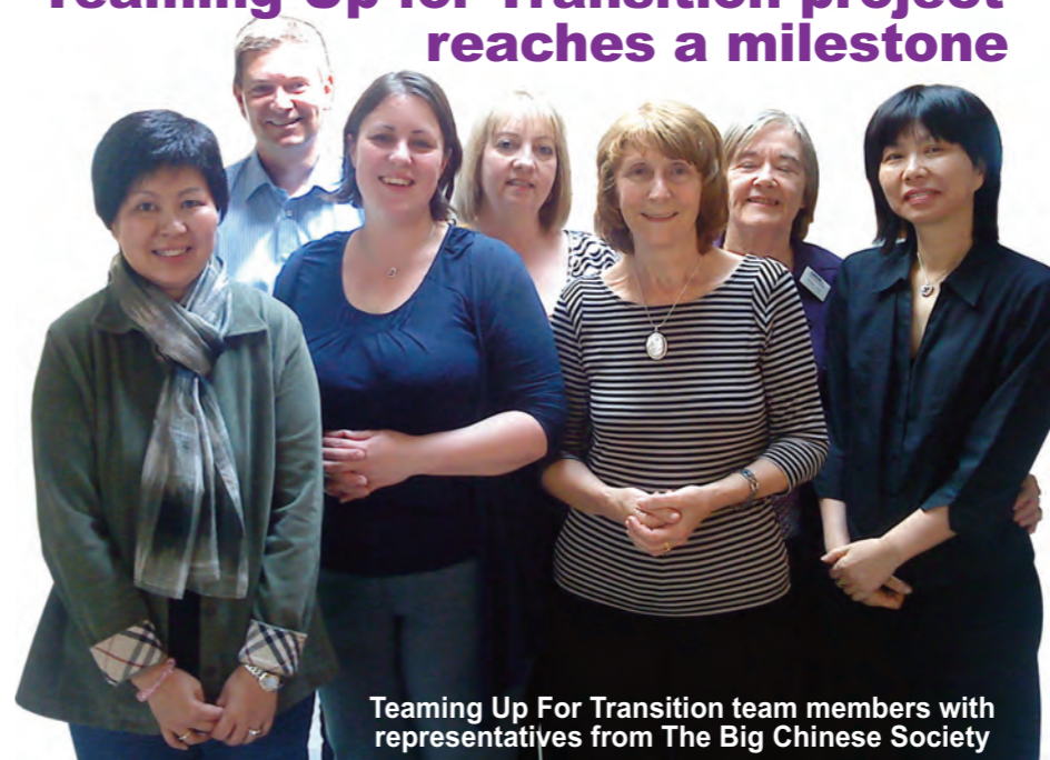
Teaming Up For Transition team members with representatives from The Big Chinese Society

The Teaming Up for Transition project is now into its second successful year working with GP's, health professionals and Carers. The project has identified and supported 455 new Carers across Derbyshire since its launch in June 2012.